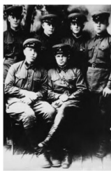
99. Zabiera 132 rodzinom Wojsk Kosciuszki NKWD z Rosji i z Ukrainy. Rodziny nie odwołują powagi z deportowaną ludnością polską.