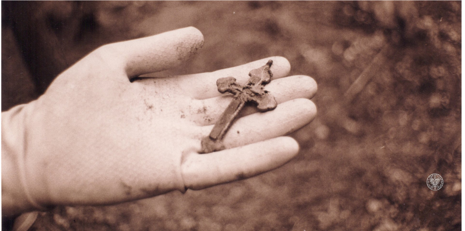
Cross found in a grave of Polish officers in Katyń. Photography from the collection of the Institute of National Remembrance acquired from the Polish Army Veterans' Association in America